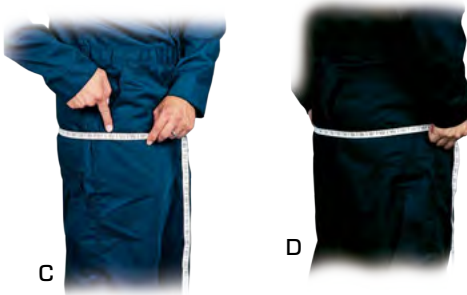
USING A TAPE MEASURE