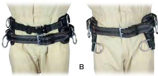
CORRECTLY SIZED TOOL BELT